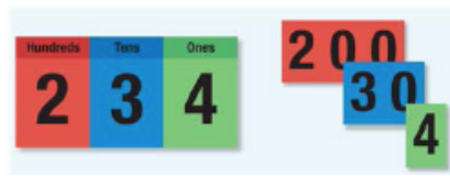
(Above) Place Value Chart, to the millions place